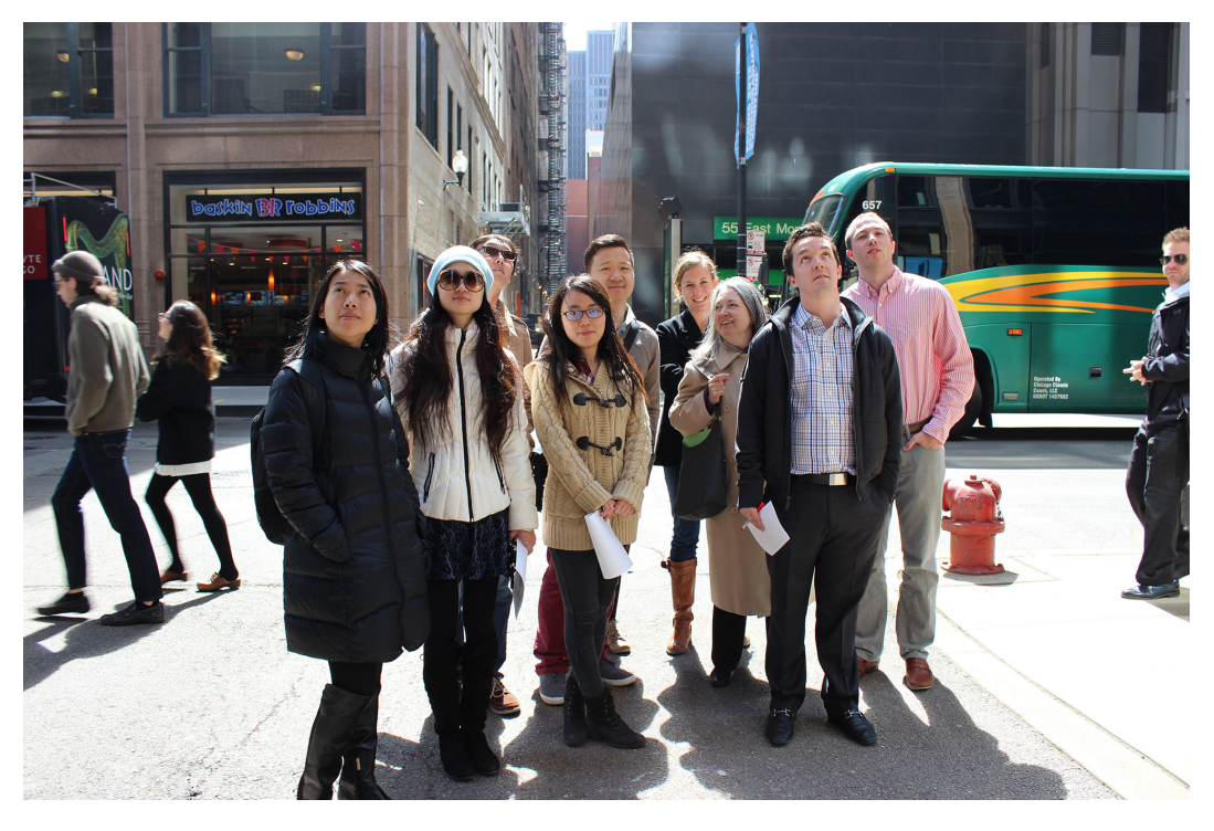
"Being at VOA has given me a better idea of where I want to be after I graduate. Also, it's a really nice place."